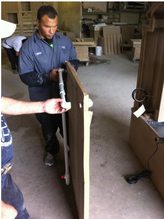
#3. Attaching plumbing.